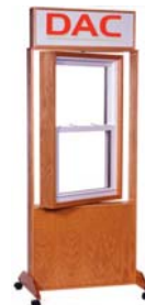
Kick Panel with Inter-frame Swivel

Shown With Optional Sign See Accessories