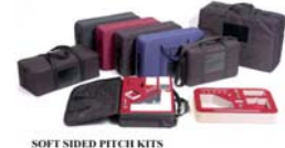
SOFT SIDED PITCH KITS